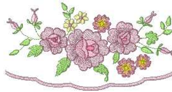
Ee007a_07.art60 168.10x78.90 mm; 26,548 stitches 6 thread changes; 6 colors