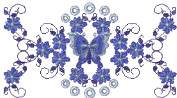
Ee007a_08.art60 167.90x86.90 mm; 17,902 stitches 10 thread changes; 10 colors