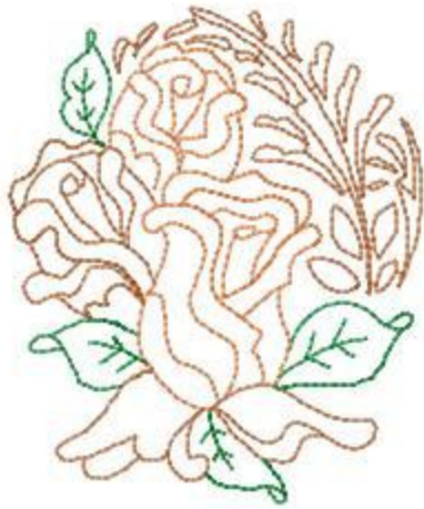
Name: Roseline3 File: Roseline3.PES Stitches: 3391 Size: 81.0x97.6 mm