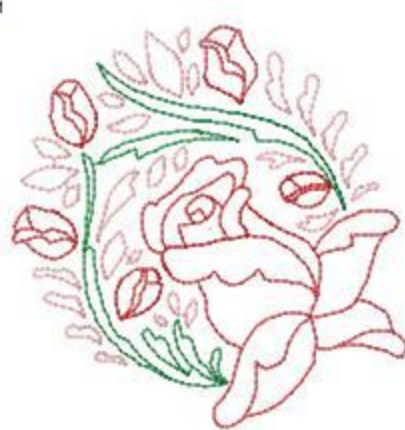
Name: RoseLine7 File: RoseLine7.PES Stitches: 3615 Size: 96.0x97.6 mm