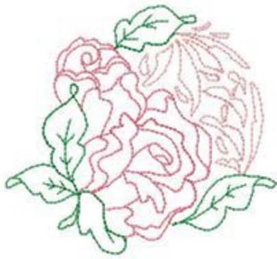
Name: RoseLine1 File: RoseLine1.PES Stitches: 2979 Size: 98.0x89.5 mm