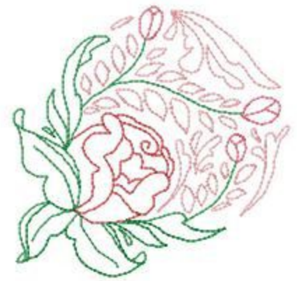
Name: RoseLine5 File: RoseLine5.PES Stitches: 3691 Size: 97.3x94.6 mm