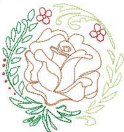
Name: RoseLine9 File: RoseLine9.PES Stitches: 3494 Size: 90.6x96.6 mm