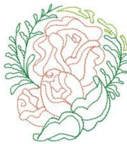
Name: RoseLine4 File: RoseLine4.PES Stitches: 3177 Size: 88.5x98.3 mm