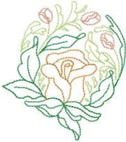
Name: RoseLine6 File: RoseLine6.PES Stitches: 3216 Size: 86.7x97.7 mm