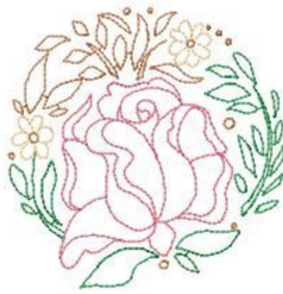
Name: RoseLine10 File: RoseLine10.PES Stitches: 3606 Size: 96.7x98.3 mm