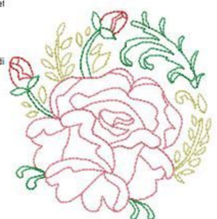
Name: RoseLine8 File: RoseLine8.PES Stitches: 3508 Size: 93.4x97.1 mm