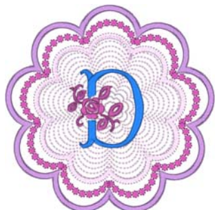
D.pes 3.91x3.91 inches; 7,089 stitches 4 thread changes; 4 colors