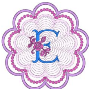
E.pes 3.91x3.91 inches; 7,172 stitches 4 thread changes; 4 colors