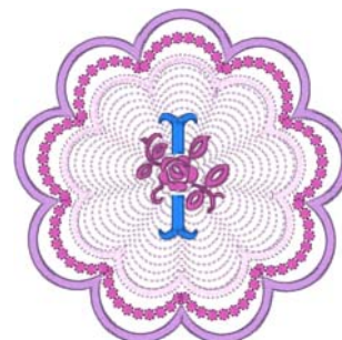
I.pes 3.91x3.91 inches; 6,805 stitches 4 thread changes; 4 colors