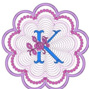
K.pes 3.91x3.91 inches; 7,202 stitches 4 thread changes; 4 colors