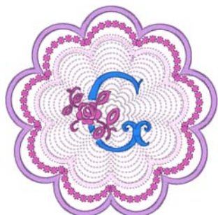
G.pes 3.91x3.91 inches; 7,150 stitches 4 thread changes; 4 colors