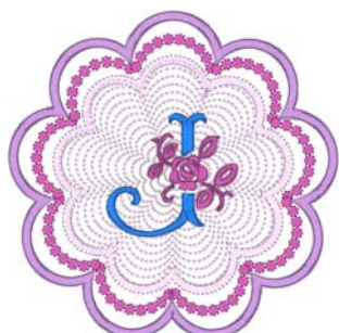
J.pes 3.91x3.91 inches; 6,970 stitches 4 thread changes; 4 colors