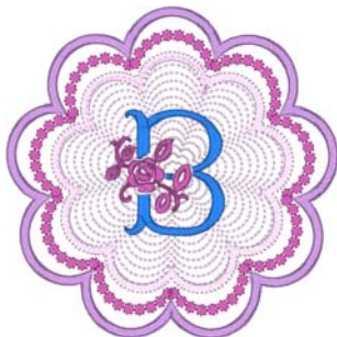
B.pes 3.91x3.91 inches; 7,204 stitches 4 thread changes; 4 colors