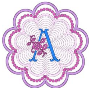
A.pes 3.91x3.91 inches; 7,130 stitches 4 thread changes; 4 colors