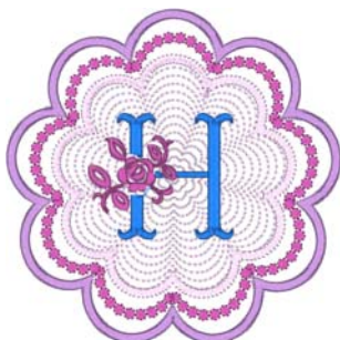
H.pes 3.91x3.91 inches; 7,380 stitches 4 thread changes; 4 colors