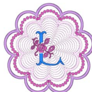
L.pes 3.91x3.91 inches; 6,921 stitches 4 thread changes; 4 colors