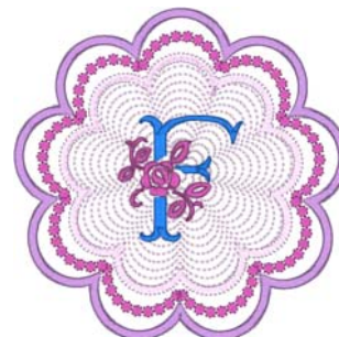
F.pes 3.91x3.91 inches; 7,074 stitches 4 thread changes; 4 colors