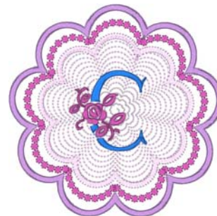
C.pes 3.91x3.91 inches; 6,971 stitches 4 thread changes; 4 colors