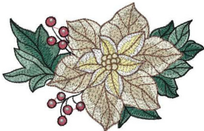
White And Gold Poinsettia_5x7.pes 128.10x81.90 mm; 20,813 stitches 14 thread changes; 12 colors