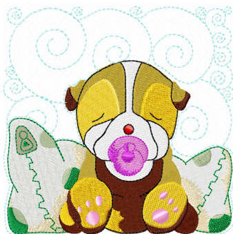
Name: puppyquilt2 File: HSCQT102 pes4CAT Is09.pes Stitches: 28357 Size: 5.14x5.07 " Colors: 14/15 Stops: 14