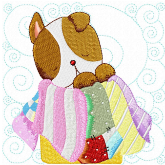
Name: puppy4 File: HSCQT104 pes4 CAT Is09.pes Stitches: 30415 Size: 4.99x5.02 " Colors: 20/24 Stops: 23