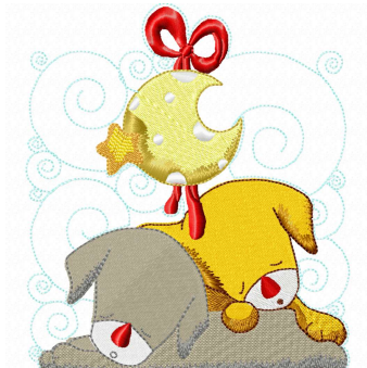
Name: puppy File: HSCQT110 pes4 CAT Is10.pes Stitches: 28622 Size: 5.05x5.84 " Colors: 12/15 Stops: 14