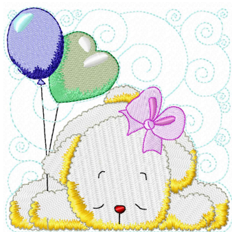
Name: babyquilt File: HSCQT101 pes4CAT Is09.pes Stitches: 41536 Size: 5.17x5.07 " Colors: 14/17 Stops: 16