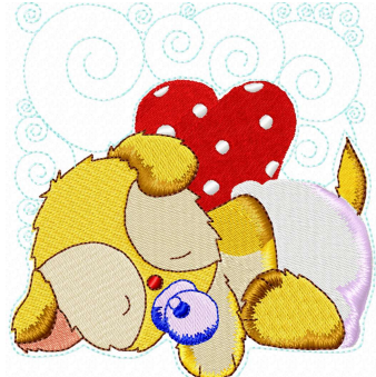
Name: puppy5 File: HSCQT105 pes4 CAT Is10.pes Stitches: 28275 Size: 5.06x5.29 " Colors: 10/16 Stops: 15