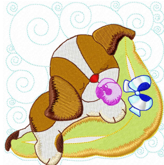
Name: puppy File: HSCQT109 pes4 CAT Is10.pes Stitches: 33092 Size: 5.06x5.29 " Colors: 12/15 Stops: 14