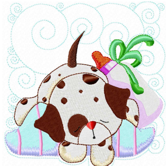
Name: puppy11 File: HSCQT111 pes4 CAT Is10.pes Stitches: 27912 Size: 5.02x5.28 " Colors: 13/17 Stops: 16