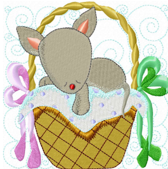
Name: Puppy File: HSCQT106 pes4 CAT Is10.pes Stitches: 31837 Size: 5.04x5.13 " Colors: 15/19 Stops: 18