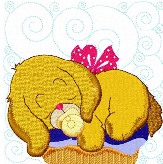
Name: puppy File: HSCQT112 pes4 CAT Is10.pes Stitches: 31452 Size: 5.02x5.17 " Colors: 13/16 Stops: 15