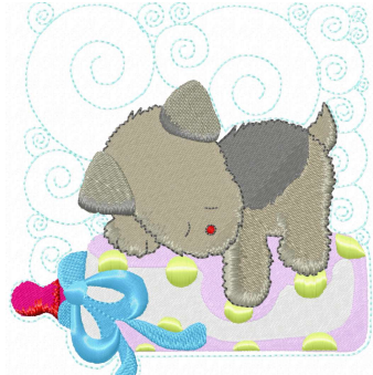
Name: Puppy8 File: HSCQT108 pes4 CAT Is10.pes Stitches: 27764 Size: 5.06x5.31 " Colors: 11/16 Stops: 15