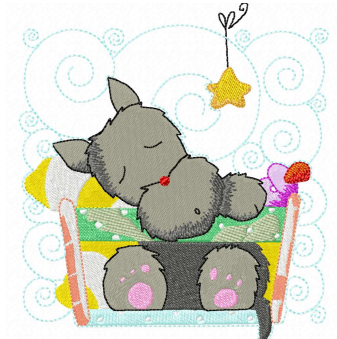
Name: babyquilt3 File: HSCQT103 pes4 CAT Is09.pes Stitches: 30116 Size: 4.96x5.54 " Colors: 16/19 Stops: 18