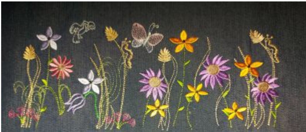
My double border

Thread colours are totally going to depend on you. Part of the fun. My single border