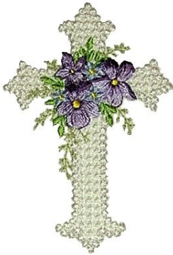
Cross13 65.50x100.00 mm; 7,660 stitches; 8 colors