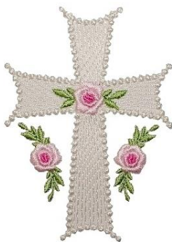
Cross15 69.00x96.20 mm; 6,545 stitches; 5 colors