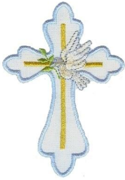
Cross11 70.60x99.50 mm; 4,881 stitches; 5 colors