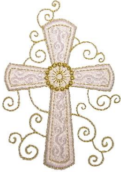
Cross12 68.40x100.00 mm 6,641 stitches; 3 thread changes, 2 colors