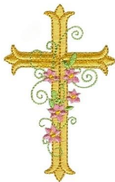
Cross09 60.20x97.60 mm; 5,026 stitches; 5 colors

Feel free to contact us at any time support@oregonpatchworks.com