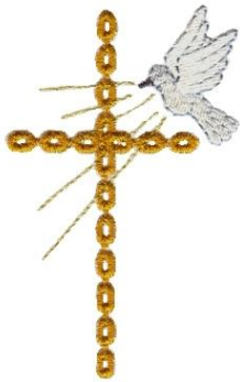
Cross14 59.50x94.50 mm; 3,156 stitches; 4 colors